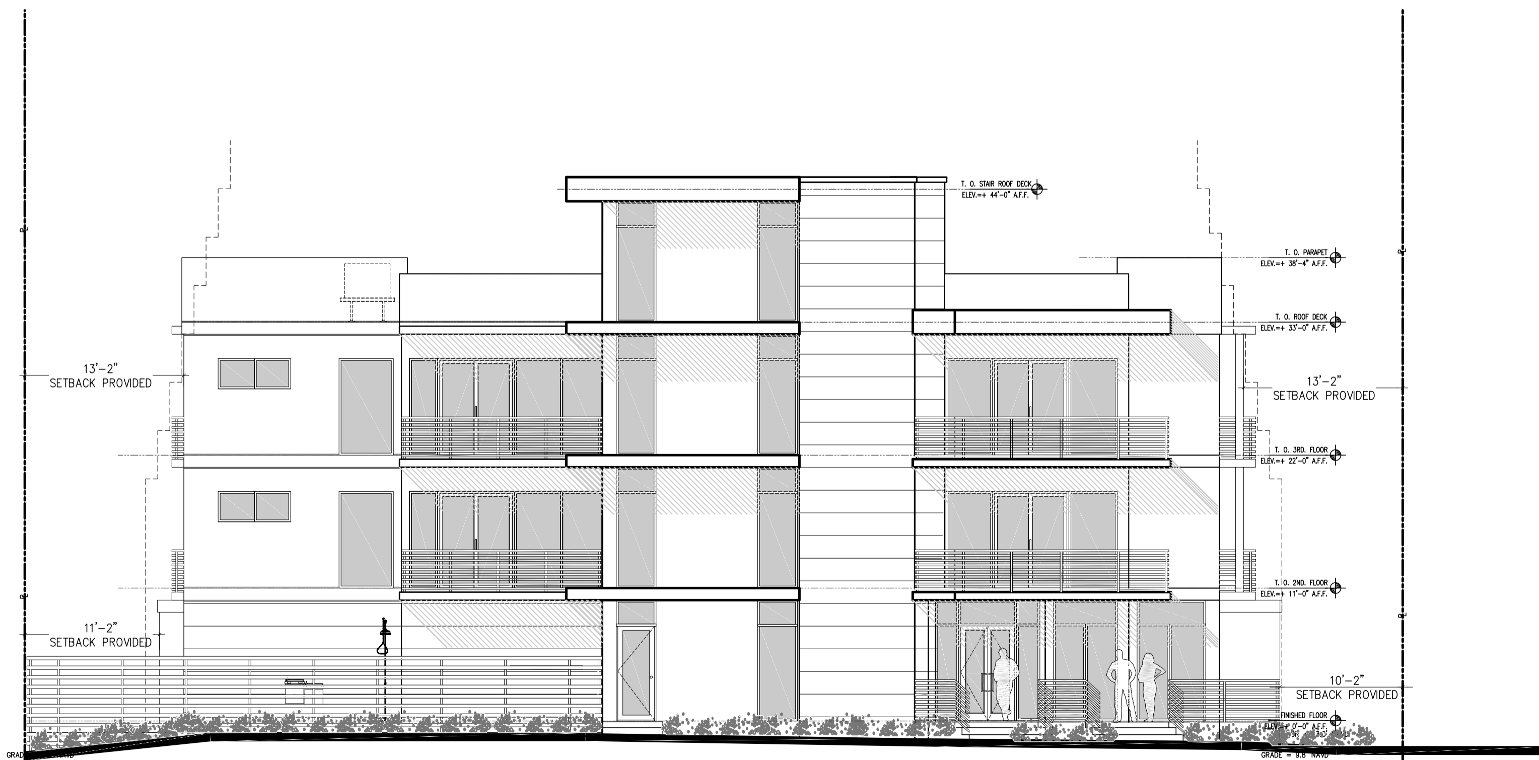
1 EAST ELEVATION SCALE: 1/8" = 1'-0"